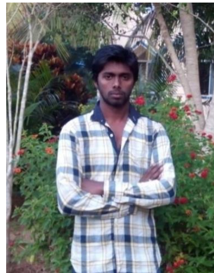
St. Gregorios Dayabhavan, Kunitgal