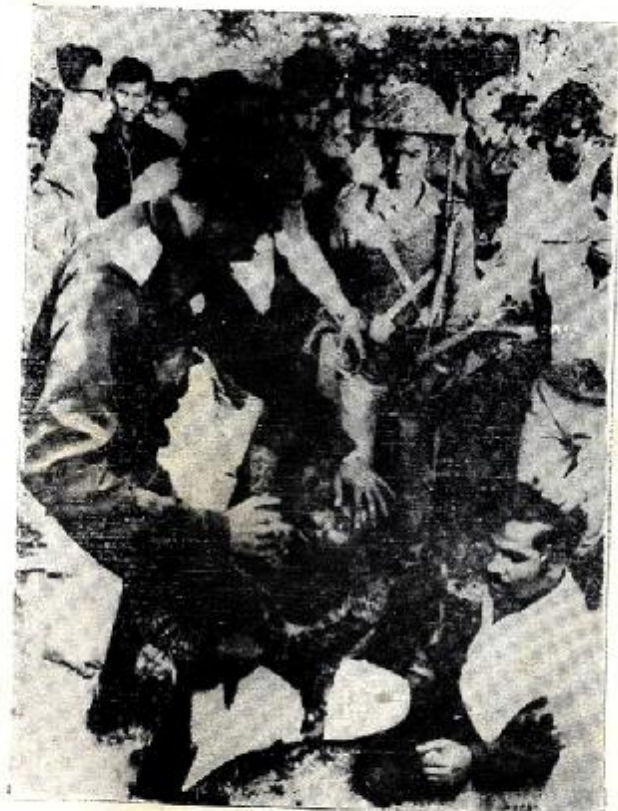
Killer presses victim's eye-socket to singe it. Another Mukti Bahini gunman grabs head of another Bihari victim for burning his eyes before the kill.