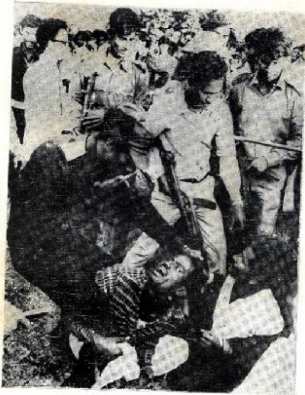
Puffing the cigarette to red-hot glow, Mukti Bahini killer, donning fur-trimmed forage cap, kneels and grabs forehead of Bihari victim to burn his eye. Other rebels, toting Indian guns, and crowd watch macabre scene expectantly.